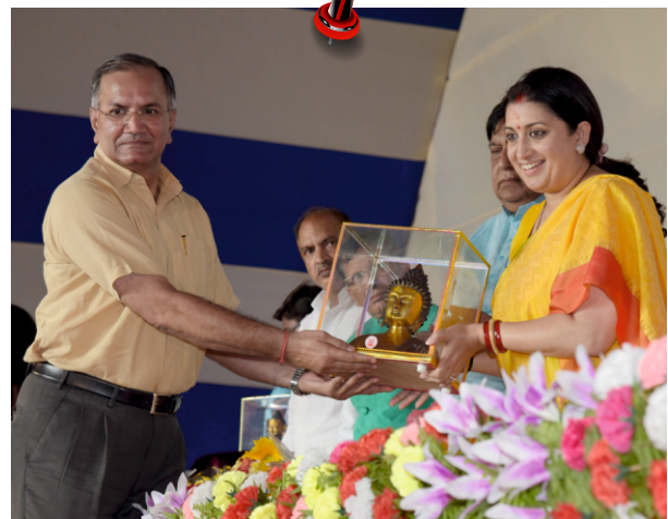
Foundation Laying of Buildings 31st August, 2015