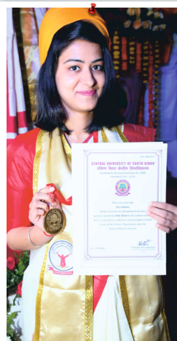
A Gold Medalist in 2nd Convocation 27th March 2018

Presently University offers 45 courses, viz, 3 UG, 23 PG & 19 Ph.D. programmes.