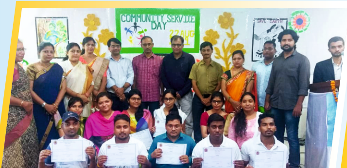
M.Ed. students spread awareness about water protection & waste management at AM College on 22nd August, 2019