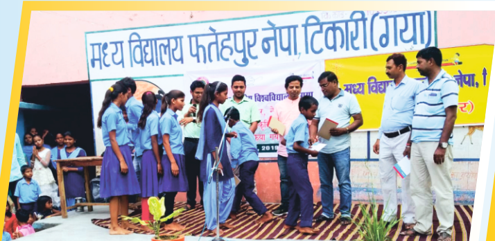
CUSB trainee teachers organised cultural programmes at Middle School Nepa on 11th October, 2019