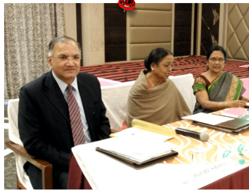
2nd Court Meeting 8th December, 2015