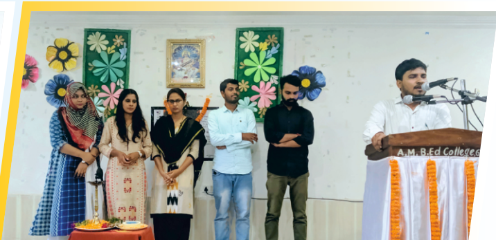
Trainee teachers of Dept. of Education performed at AM College Gaya on 09th August, 2019