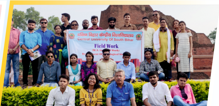
MA Social Work students on field work to ruins of Nalanda on 22nd August, 2019