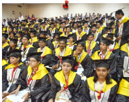
Graduating students in 1st Convocation 26th September 2013