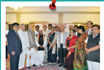
1st Court Meeting 17th November, 2014