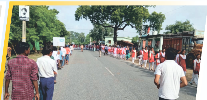
Prabhats Pheri organised by students of CUSB at High School/ Middle School Tapa (Fatehpur) on Gandhi Jayanti (2nd Oct.)