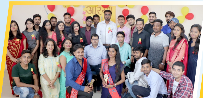
Freshers' Party at Dept. of Mass Communication on 06th September, 2019