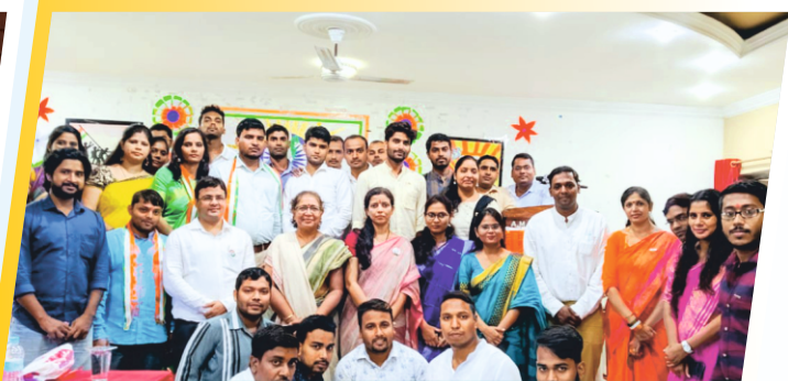
M.Ed. students of CUSB celebrated Independence Day at AM College Gaya on 15th August, 2019