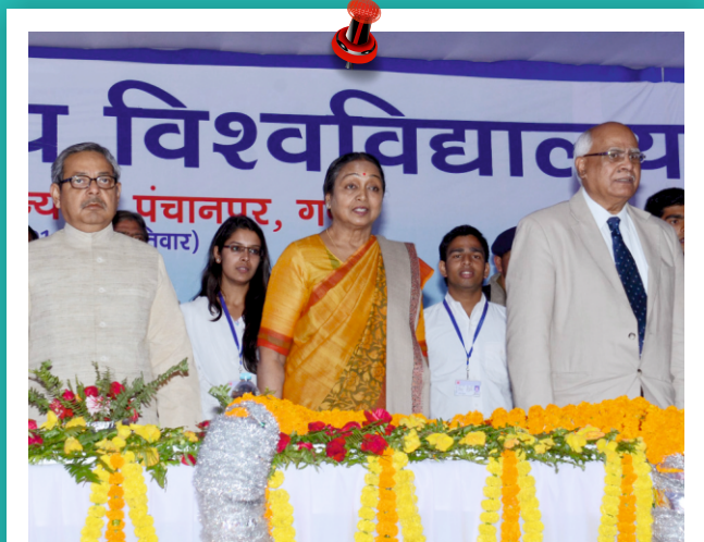
Bhoomi Pujan of CUSB campus 27th February, 2014