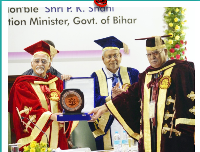
1st Convocation of CUSB 26th September, 2013