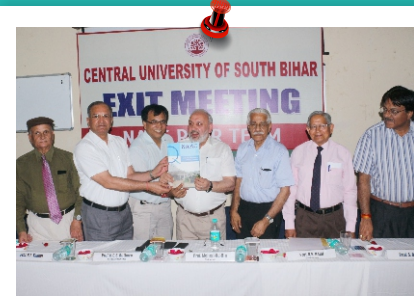
NAAC Exit Meeting 29th April, 2016