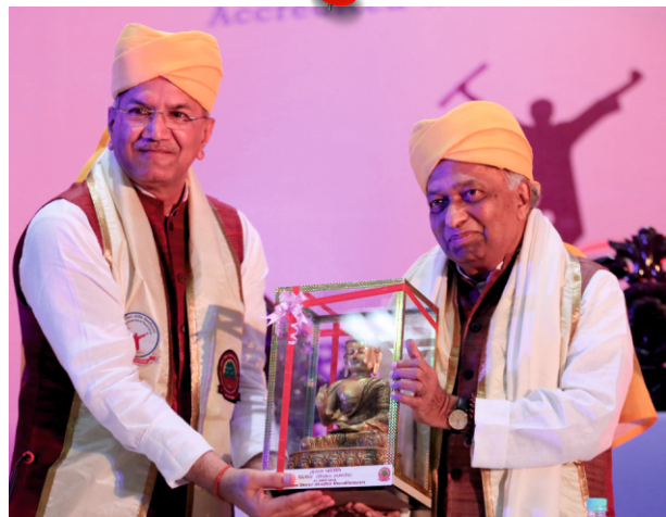
2nd Convocation of CUSB 27th March, 2018