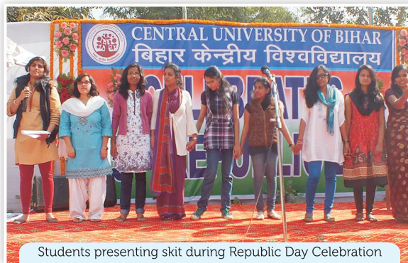
Students presenting skit during Republic Day Celebration

Central University of Bihar (CUB) celebrated the 65th Republic Day at its Patna and Gaya campuses with great fervour and gaiety. The Republic Day celebration at University Guest House in Patna started with guard of