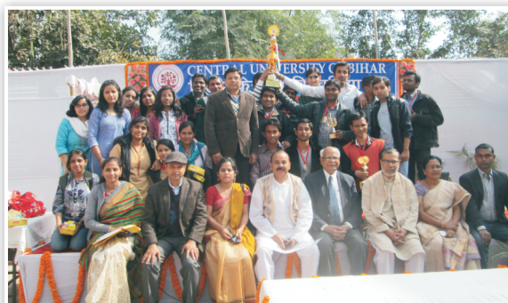
VC, Pro-VC, Registrar, COE with winners of sports events

The New Year 2014 began in a quite relaxing yet competitive way for the students as from the second week the University's Games and Sports Committee organised the Annual Sports events featuring games of