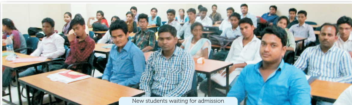
New students waiting for admission