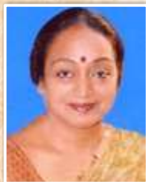
Hon'ble Smt. Meira Kumar Chancellor of the University & Speaker, Lok Sabha