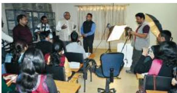
VC Prof. Janak Pandey interacting with students during Four-day Workshop on Photography