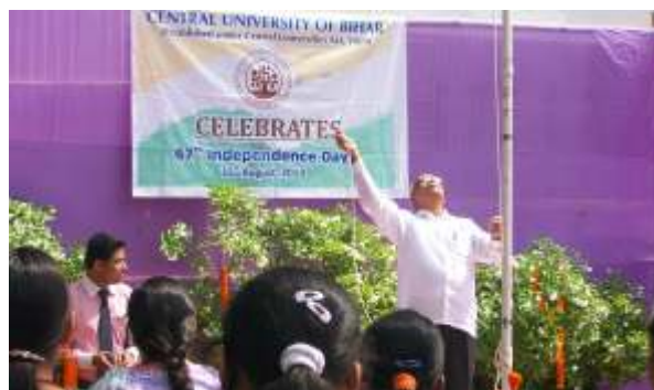
The Vice Chancellor hoisting the national flag on the occasion of 67th Independence Day

CUB celebrated Independence Day on 15 th August 2013 with pomp and panoply. The Vice Chancellor along with students, faculty, administrative staff, their families and other dignitaries were present on the occasion. Following the felicitation from the Guard of Honour and flag hoisting by the Vice Chancellor a cultural programme based on the nationalistic leitmotif was presented by CUB students.