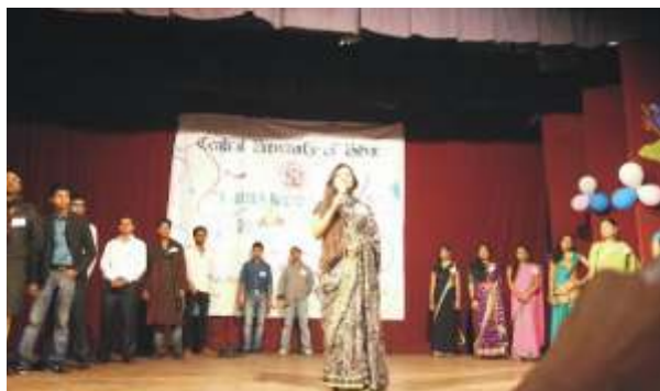
Students on stage during Fresher's Programme 'Roobaroo-2013'