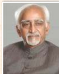
Chief Guest Hon'ble Shri M. Hamid Ansari Vice President of India

Chief Guest: Hon'ble Shri M. Hamid Ansari, Vice President of India Chair Person: Hon'ble Smt. Meira Kumar, Chancellor of the University